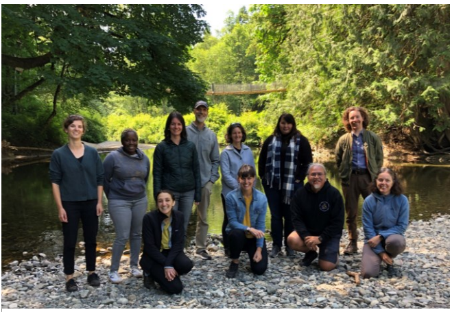
Xwulqw'selu Watershed Planning Team with G2G Leaders June 2023, Bright Angel Park